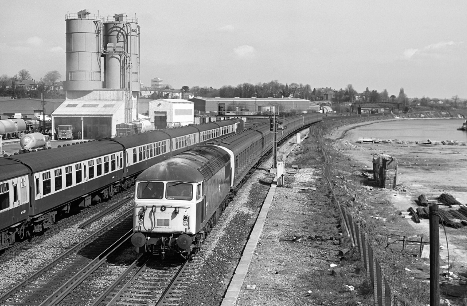
Above: Photographed just south of St Denys, heading for Northam Junction and passing Beovis Park Yard, rail blue Class 56 No. 56034 hauls three Class 405 4SUB units Nos. 4670, 4680 and 4742 as a 'load' during a Class 56 driver training run from Eastleigh to Eastleigh via Southampton, Laverstock, Andover and Basingstoke on 12 April 1984. On the 'up' line Class 33 No. 33002 passes by with the 08.05 Cardiff-Portsmouth Harbour service. Colin J. Marsden

Photographic details: Camera: Pentax 6x7, Lens: Pentax 105mm, TriX at 400ASA, Exposure: 1/1000 @ f8. Negative scanned on Nikon Coolscan9000 at 600dpi.