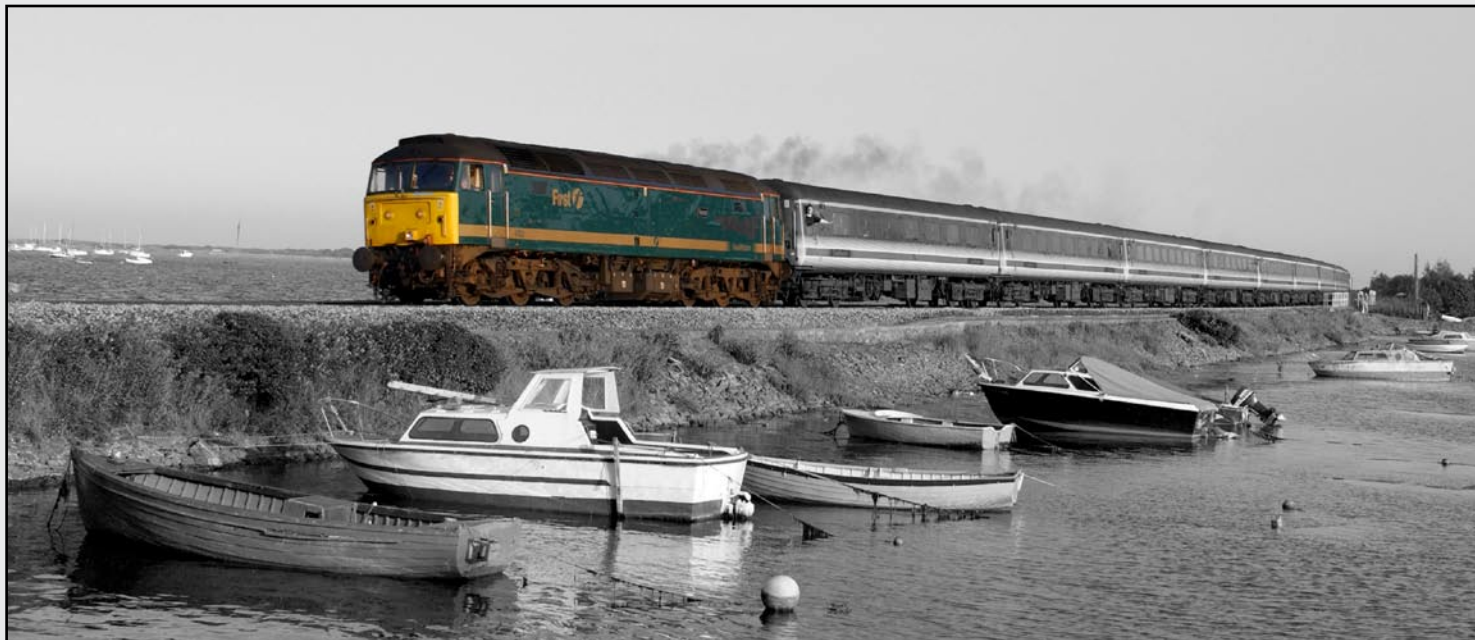
Below: The time honoured view of a train crossing Cockwood Harbour between Dawlish Warren and Starcross in Devon is such an established view that some form of adventurous photography can help produce a different view. Here, this view of an FGV Class 47 powering an 'up' Mk2 formed passenger rake, has just had the loco returned to colour, leaving the rest of the scene and train in monochrome. Originally when this picture was converted, the editor looked twice at the underframe colour of the Class 47, which looks very orange, rather than the expected black. It was surprising to note that this was the colour on the original colour illustration, but the eye was distracted from it by the presence of the other colours. Colin J. Marsden

When you have returned the colour to the area you wish, you may then need to do some final adjustments in terms of contrast and colour to make the image as you require. Have fun, perhaps not recommended for general railway photography, but it is another form of a 'picture with a difference' and usually one or two of these in a photo gallery generates some comments and interest.