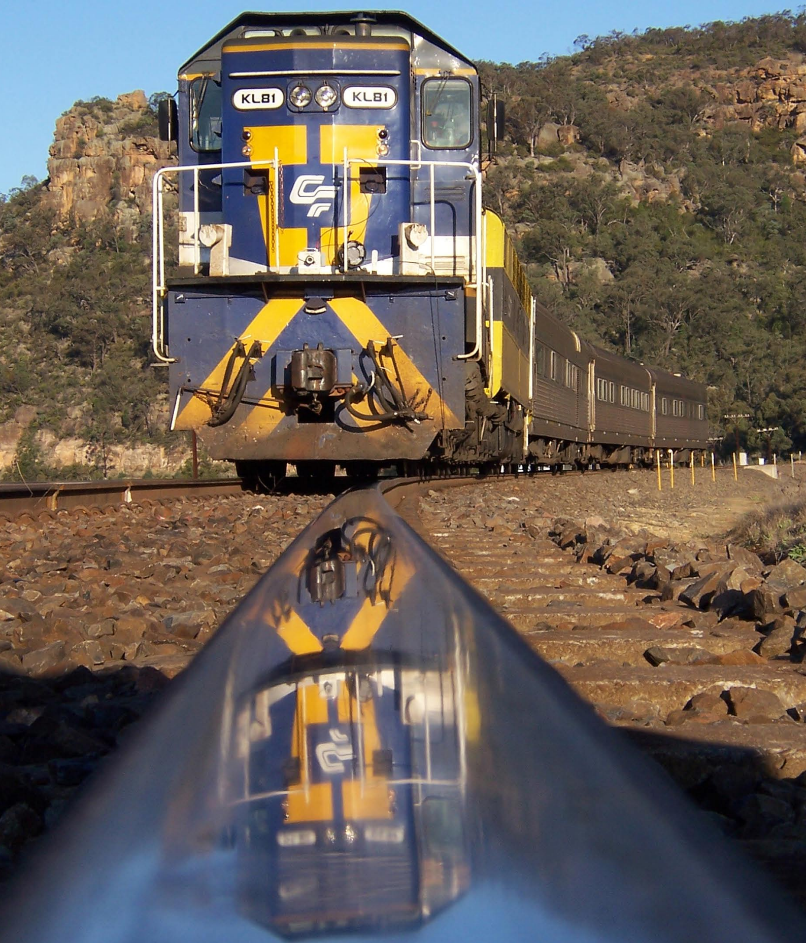
A stunning reflection image using the polished railhead as a reflective surface, shows the Australian AK track recording train, stopped at the New South Wales, Hunter Valley location of Kerrabee, for safeworking purposes. The picture was taken just prior to sunset, with locos KL81/S317 powering train No. 5M83 on 29 September 2005. The photographer was part of the team working on the train, so safety issues of being in such a location were taken into account. Camera details: Kodak LS743, 1/180second, 13.5mm focal length.