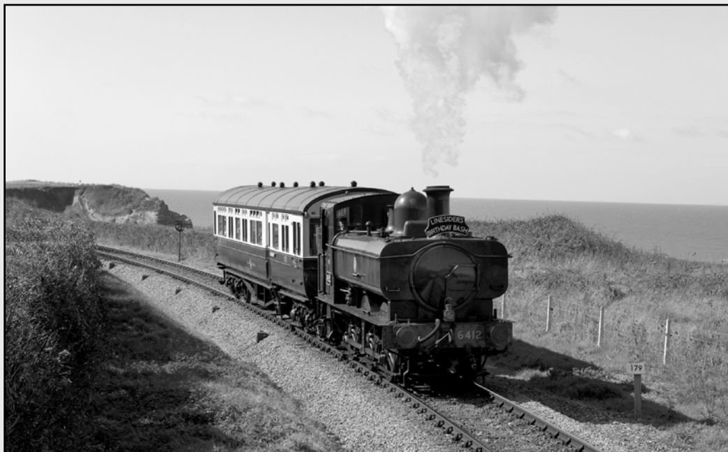
Left: Looking every bit an image of the 1950s (except for the headboard), is this view of Great Western 0-6-0 'Pannier' tank No. 6412 hauling a Great Western auto-coach along the West Somerset Railway near Doniford Beach. Apart from a few of the more well known early colour photographers such as Peter Gray and the late Dick Riley, scenes such as this were virtually all recorded in black and white and frequently colour pictures of such workings look wrong. This image originally taken on a Nikon D2X in RAW was converted to monochrome in Adobe CS2 (Photoshop) and then saved as a .jpg file. Often when converting colour to black and white some attention to contrast is needed or the sky area will need adjustment, as the blue often converts into a too dark grey. The train illustrated was a 'Birthday Bash' for railway photographer Terry Harper or 'Linesider', who sadly passed away a few months later. Colin J. Marsden

Today, a number of digital photographers who usually take pictures in the colour medium, choose to convert their images into black and white, this is frequently the case with steam or early diesel illustrations, where photographers are trying to recreate the scenes recorded several decades ago. At other times, especially on main line steam charters, the conversion of illustrations to black & white removed the motley collection of different coloured rolling stock found on charter workings and blends the image into an era past. In most cases conversion of images from colour to black and white is easily done in the post taking editing, by using the mode control and saving the image as 'black and white' rather than RGB or CMYK colour. A tip for those planning on using this process and then having their work published, is that reproduction will be better if the image is then re saved as RGB or CMYK.