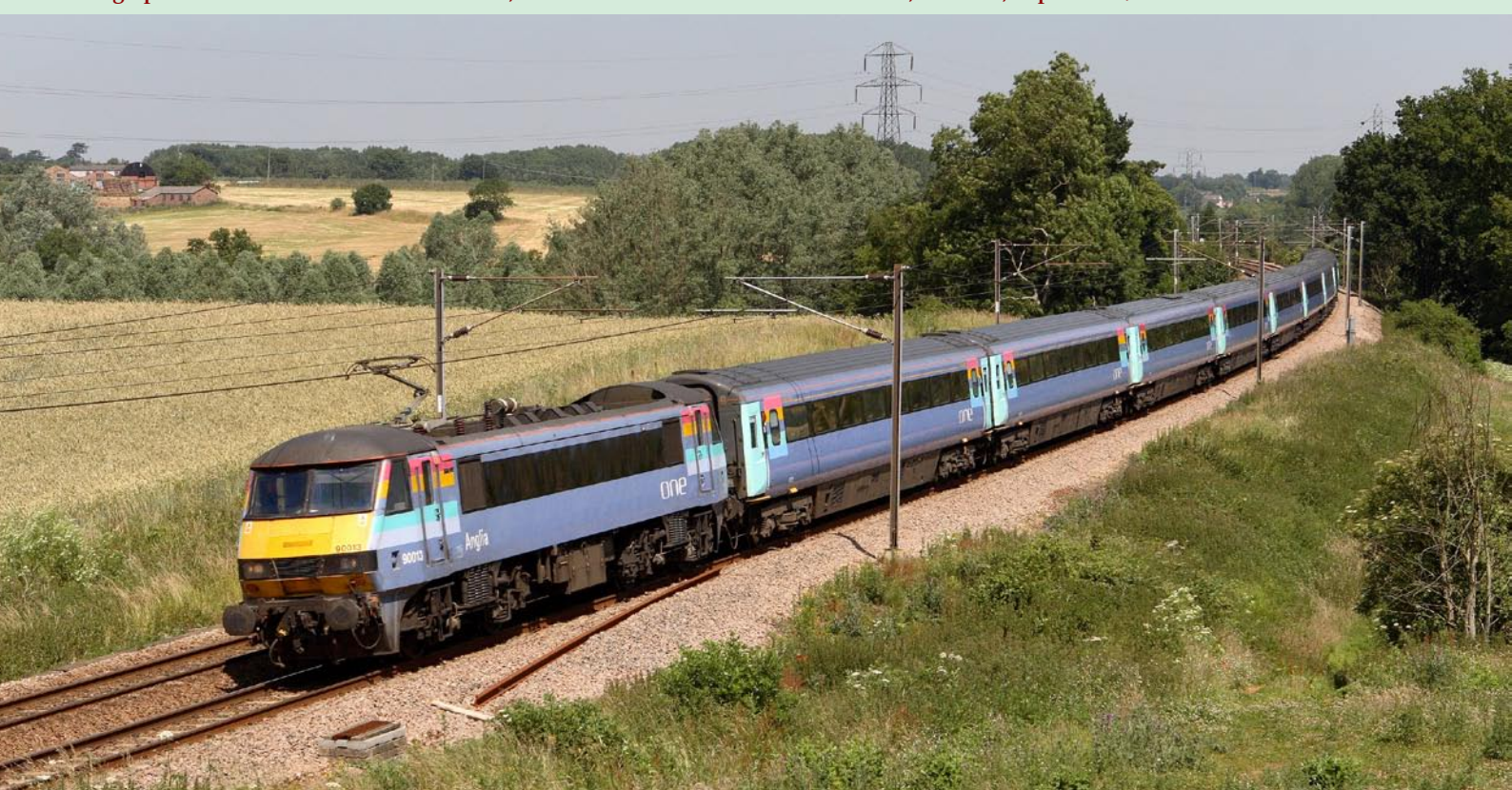
Below: The new order of the day on the 'one' Anglia main line, Class 90/0s powering rakes of Mk3 stock. Although new to the Norwich-Liverpool Street route, these locos are far from new, being used by InterCity and then Virgin Trains on the West Coast route until displaced by Pendolino stock. On 29 June 2006, No. 90013 is seen at Brantham, south of Ipswich powering the 11.00 Norwich-Liverpool Street. Shaun Bamford Photographic details: Camera: Canon EOS30D, Lens: Canon 28-70mm f2 zoom at 50mm, ISO: 400, Exposure: 1/1000 @ f8