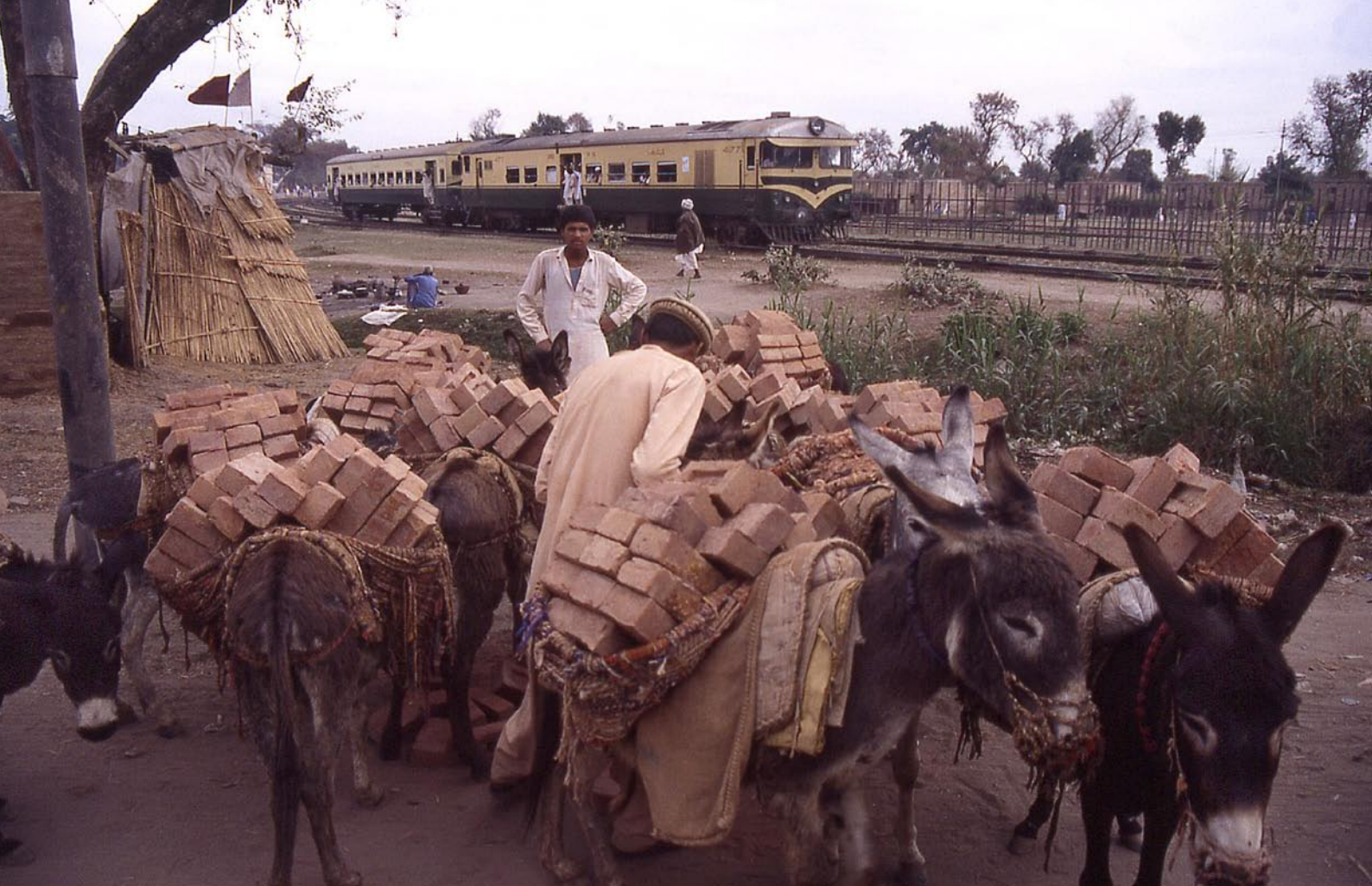
Above: Most photographers would have probably taken this view of a vintage Pakistan diesel multiple unit at Malakwal with a service for Bhera on 6 March 1988 as a close up front three-quarter view showing more detail of the train and surrounding station. However, the photographer here has managed with careful thought of position to include some of the local 'transport' in the picture. It is very doubtful that this method of transporting building materials would be allowed in many countries of the world. Phil Cotterill