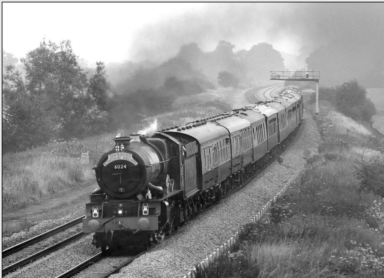
Above: GWR 'King' Class 4-6-0 No. 6024 King Edward I powers the 10.50 Paddington to Bristol Temple Meads 'The Brunel Bicentenary Special' formed of the VSOE Pullman stock past Shrivenham on 5 July 2006. This period illustration is considerably enhanced by the removal of the colour, and at first glance could well have been an illustration taken some 40 years ago. Ken Brunt