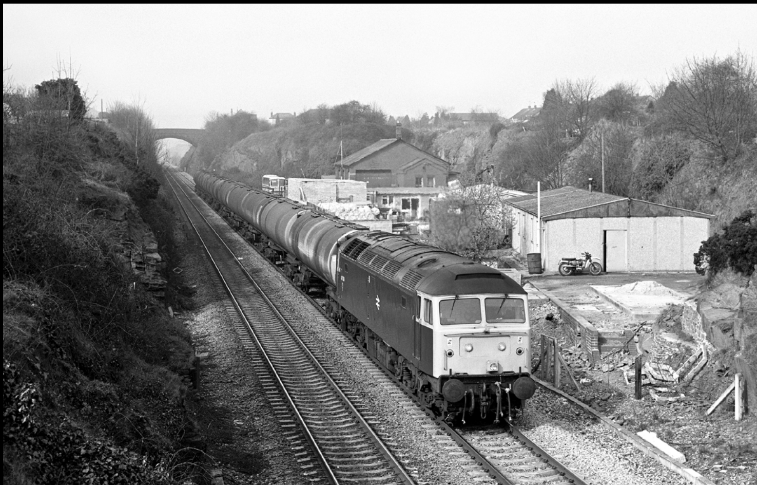
Photographic details: Camera: Pentax 6x7, Lens: Pentax 105mm, TriX at 400ASA, Exposure: 1/1000 @ f7.1. Negative scanned on Nikon Coolscan9000 at 600dpi.