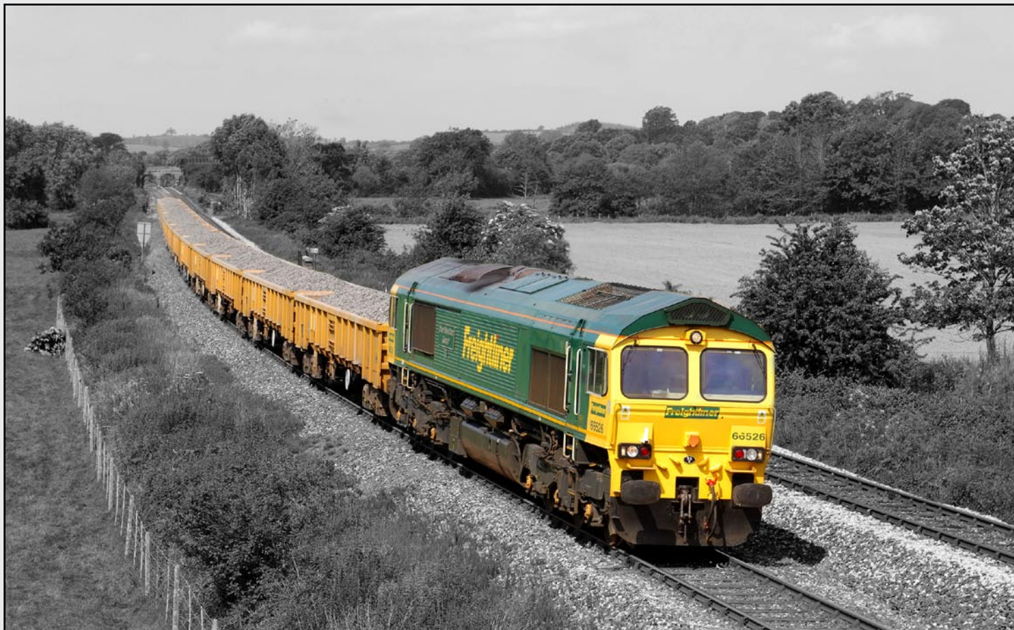
Above: In what was a very heavy green landscape, of like coloured loco and landscape, this colour/monochrome 'selection' has lifted the green loco and yellow wagons out of the scene. It is frequently quite amazing how many people look at this type of illustration and at first do not see that the landscape is not the usual colour. This view was taken at Gunstone Mill on the Crediton-Meldon Quarry line on 8 June 2005 and shows Freightliner Heavy Haul No. 66526 powering the 10.30 Meldon Quarry-Oxford Hinksey Network Rail ballast service. Colin J. Marsden

Another form of black & white or monochrome photography which has caught on in recent months is the mix of black and white and colour within the same illustration. This was possible in wet film days, but with the onset of the digital era, it has become easier to achieve. For those who wish to apply this art to their illustrations, this is the method adopted to produce these two pictures. Firstly open the original colour illustration and do any editing in terms of colour, spot removal and trimming, then (if you are using Photoshop) go to Image>Adjustments>Desaturate, this will convert the entire image into black and white. To return the colour to the section of the image you require, go to the main pallet menu and select the History Brush Tool, then using a very small brush size and with the picture enlarged so you can see what you are doing, rub over the area in which you wish colour to return, this is best done in small strokes as if you make a slight error, you can easily 'step back' and try again.