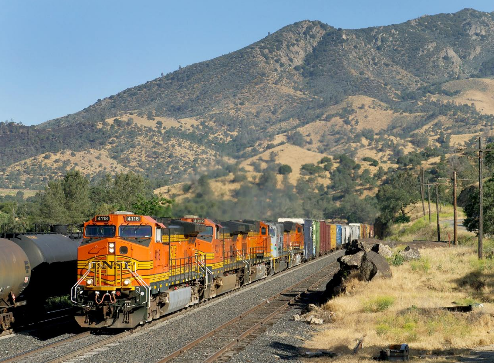
Above: Placing trains in mountain scenery in Southern California is a personal favourite of this photographer. The curved and undulating route between Mojave and Bakersfield via Tehachapi offers such a setting. On 3 June 2006, a northbound BNSF manifest train passes Woodford, just north of the Tehachapi Loops led by four BNSF Dash9s (BNSF4118, BNSF4332, BNSF4056, BNSF5480) and an SD70Mac No. 1630 from Mexico-operator TFM. Colin J. Marsden Photographic details: Camera: Nikon D2X Lens: Nikkor 28-70mm f2.8 zoom at 65mm, ISO: 200, Exposure: 1/800 @ f5.6