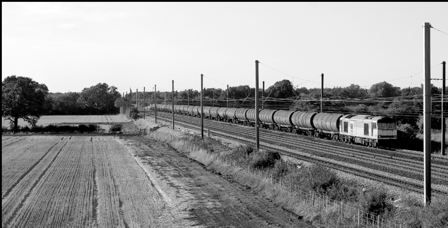
Above: An image taken in digital colour and then converted to monochrome, shows EWS-branded grey-liveried Class 60 No. 60079 powering train 6D43, the 13.51 Jarrow to Lindsey empty bogie tanks passing Raskelf north of York on the East Coast Main Line on 3 August 2006. The photographer noted that the photographic conditions included slightly awkward light, firing slightly towards the setting evening sun. Photographic details: Camera: Canon EOS 30D, Lens: Canon, ISO: 400, Exposure: 1/800 @ f7.1 taken in RAW format and processed through 'Neat Image and 'Photoshop'