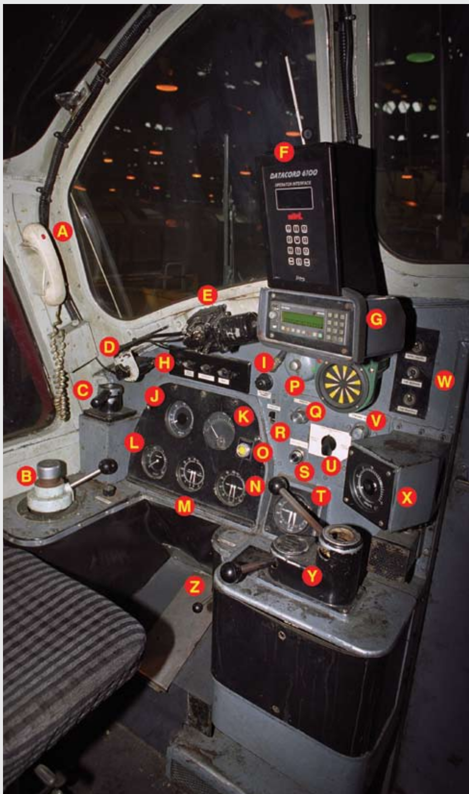
Class 37 driving cab layout

If you choose to make your text additions in DTP software, much the same process is followed, but the layer does not form part of the picture, it is always separate and needs careful positioning.