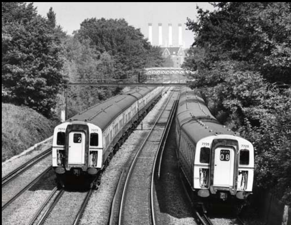
Left: Some of the most popular Southern Region electric multiple units of recent years has been the 1963-stock, consisting of CIG, BIG, VEP, VEG and VAB units. The CIG/BIG types were low density with 2+2 seating, while the VEP, VEG and VAB sets were high-density with an external door by each seating bay with seats in the 3+2 style. In this view at Wandsworth Common a 4CIG (later Class 421) No. 7373 races south on the main line, while 4VEP (later Class 423) No. 7725 trundles south on the local track with empty stock from London Victoria on 13 August 1981.