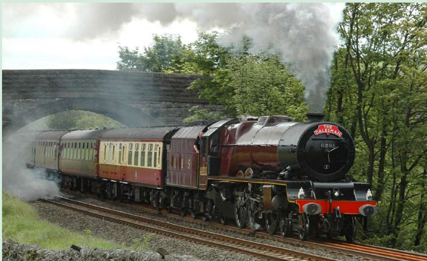
Below: Always popular with the cameraman is LMS 4-6-2 No. 6201 Princess Elizabeth, which sees frequent use on the UK main lines powering charter trains. On 4 June 2006 the loco was in charge of 'The Dalesman' charter between Carlisle and Hellifield and seen near Stainforth, about five miles north of Settle. Photographic details: Camera: Nikon D70, Lens: Nikon 24-135mm zoom at 85mm, ISO: 400, Exposure: 1/250sec @ F11