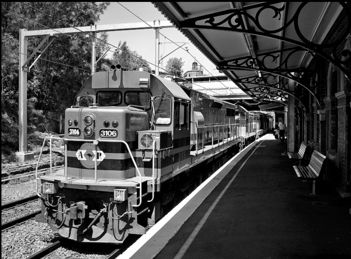
Above: Taken on a glorious Tuesday 16 January 2007 during the Southern hemispheres summer, train No. 9182, an Australian Railroad Group (ARG) container freight from Bomaderry (on the New South Wales south coast) to Cooks River (Sydney) powered by locomotives 3106, T387, 4908 and 2203, pass Canterbury in suburban Sydney. Photography of a train from the platform side in such harsh lighting conditions can be very difficult and our photographer here, through careful exposure and then conversion of his colour digital file to monochrome, has produced a stunning pictorial result. Chris Walters Photographic details: Camera: Pentax *ist DL, Lens: Pentax 18mm, ISO: 200, Exposure: 1/500 @ 5.6