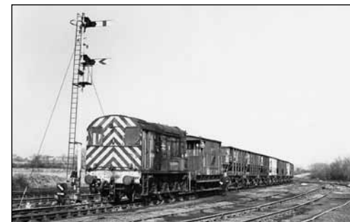
Photographed just a month before withdrawal from Burton depot, No. 08046 shunts coal hoppers at Coalville on 11 April 1980. Introduced in August 1954, a product from Derby Works, this loco is now preserved at the Caledonian Railway, Brechin.