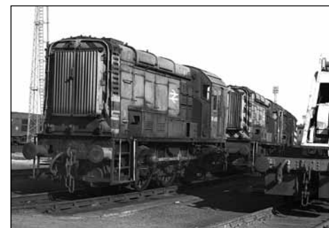
In the days when Thornaby still had a thriving diesel depot, Class 08 No. 08058 awaits its next duty on 11 October 1981. This vacuum braked only example looks to have seen better days and only remained in traffic for another nine months before being withdrawn. It was later cut up at Swindon Works. CJM