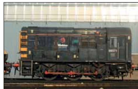
Painted in Wabtec Rail black livery with Wabtec Rail Limited branding on the engine room doors, No. 08571 is seen on hire to East Coast at Bounds Green. This loco was built at Crewe Works in June 1959 as No. D3738 and originally allocated to 64C Dalry Road in Scotland. Antony Christie