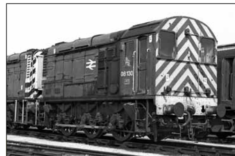
Introduced as No. 13198 in December 1955 and allocated to 66A Polmadie (Glasgow), this loco was renumbered to D3198 in September 1960 and into the TOPS system in March 1974. Showing BR standard rail blue, the loco is seen with others of the same class and a Class 37 at Springs Branch Wigan on 5 September 1981. It was withdrawn in December 1982. CJM