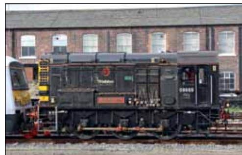
Sitting in Doncaster West Yard, Wabtec Rail No. 08669 Bob Machin shunts a Class 321 from the Wabtec Works to the National Network. Built at Crewe in January 1960, this loco was first allocated to 8F Springs Branch.