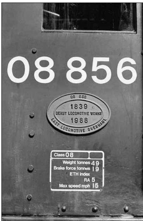
Derby Locomotive Works, the birth place for thousands of steam and diesel locomotives closed its doors to heavy loco maintenance in 1988. The final loco to receive attention was No. 08856. When it returned to traffic it carried a cast plate on the cabside to mark this fact. No. 08856 was a Horwich built '08' delivered in July 1961. After withdrawal in April 2004 it was sold to Traditional Traction and was a hire locomotive until being broken up in Dec-11 CJM