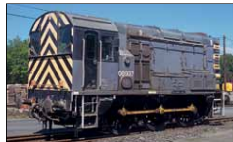
No. 08937, delivered in May 1962 to 83D as No. D4167 remained on the Western Region until 1993 when it was withdrawn. The loco then entered industrial service and is seen at Meldon Quarry in the mid-1990s named Bluebell Mel. The locomotive is now operated by Aggregate Industries and in 2011 was still working at Meldon Quarry. CJM