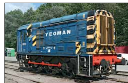
No. 08032, now preserved on the Mid Hants Railway, entered traffic in March 1954 from Derby Works and allocated to 75C Norwood Junction carrying the No. 13044, it was later renumbered to D3044 and in the early 1970s as 08032. It was withdrawn in August 1974 from Toton depot and entered industrial service with Foster Yeoman. The loco is seen at Merehead Quarry.