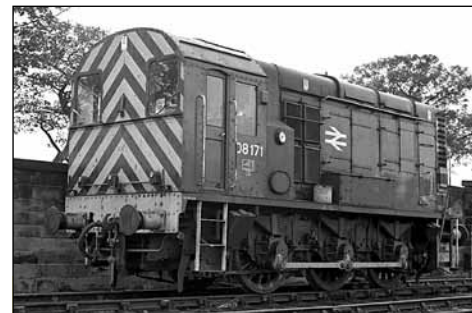
One of the Darlington built examples No. 13239, later D3239 and eventually No. 08171 is seen at Scarborough on 16 August 1980. After entering traffic in February 1956, this loco was withdrawn from York shed in April 1983 and was disposed of at BREL Doncaster in September the same year. CJM