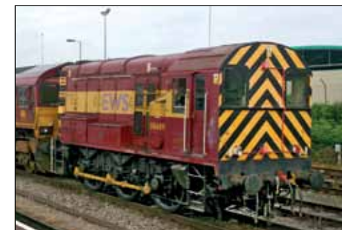
Delivered new to 27F Brunswick from Horwich Works in October 1959 as No. D3856, this loco was renumbered to 08689 in February 1974. Upon privatisation it became the property of EWS who withdrew it from service in December 2007. It was subsequently sold to European Metal Reprocessing at Kingsbury and was broken up in August 2010. It is seen at Westbury.