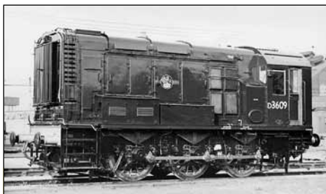
In ex-works BR green with Lion holding Wheel motif on the engine room side door is No. D3609. With a small 'D' prefix to its number, the loco is seen on delivery from Horwich Works to Stratford and was being 'accepted' at Doncaster Works on 5 April 1958. This loco went on to become No. 08494 and was withdrawn from Bletchley in August 1988 and broken up by M C Processors, Glasgow. CJM-C