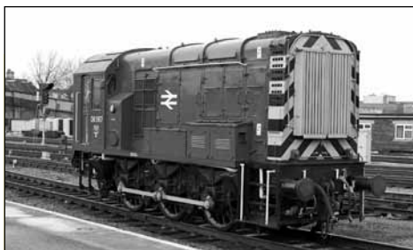
No. 08567 is seen at Hull on 18 January 1986, introduced in April 1959, this loco is still in service with DB Schenker. In the picture the loco is a dual brake example. CJM