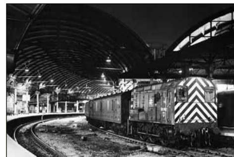
On a dark and cold January night in 1988 rail blue-liveried No. 08808 acts as the Newcastle station pilot. This loco emerged from Derby Works as No. D3976 in July 1960 and remained in traffic until May 1990. It was then sold to scrap dealer C F Booth of Rotherham who broke it up in May 1992. CJM