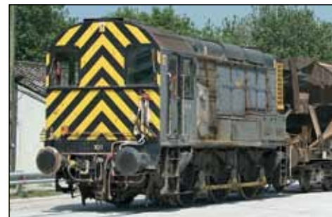
The same locomotive as in the above view, but following its total rebuild at RFS Kilnhurst as a Class 09/1 and renumbered to 09101. After a further 17 years of work as a Class 09, it was withdrawn from traffic in May 2008 and broken up by C F Booth of Rotherham in February 2011. Antony Christie