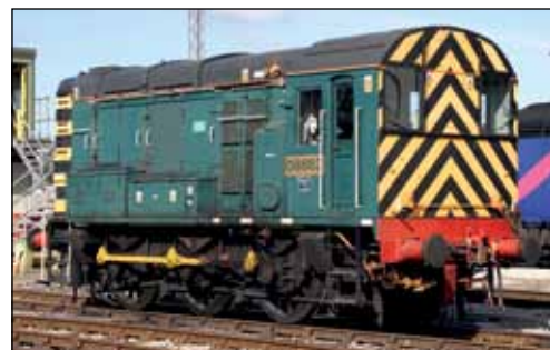
Built at Horwich Works and introduced in June 1959 to 87C Danygraig (Swansea) as No. D3830, this loco was later renumbered as 08663 and is currently on the books of First Great Western. In this view it unusually carries a gold background to its number panel, perhaps reflecting the past days of cast Great Western number plates. Kevin Wills