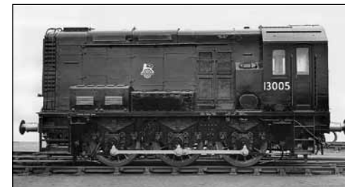
Delivered in November 1952 to 67C Ayr, No. 13005 was renumbered to D3005 in September 1958 and to TOPS number 08002 in May 1974. The loco remained operational until September 1977 when it was withdrawn from Doncaster being broken up at BREL Swindon in January 1978. CJM-C