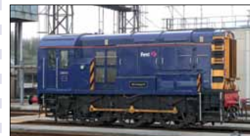
Nine standard Class 08 shunting locomotives were operated by First Great Western in 2011; these were used for depot shunting work, mainly involving re-forming of HST and loco-hauled stock. All are fitted with drop-head HST compatible couplers. No. 08645 Mike Baggott is seen at Laira depot, Plymouth, painted in all-over FGW blue, with a First Group logo on the engine bay side door. Note that yellow/black wasp ends are applied to the front of the fuel tank and compressor cabinet. Stacey Thew