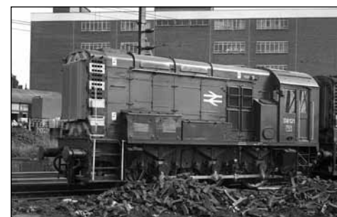
With a heap of used brake block in the foreground, No. 08121, the original No. 13188 (D3188) stands 'on shed' at Willesden DED on 21 September 1980, looking to be in near ex-works condition. This loco was withdrawn in June 1984 from Allerton depot, Liverpool and broken up at BREL Swindon. CJM