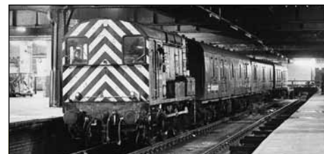
On 17 October 1984, No. 08944 positions three Newspaper vans into platform 10 at Paddington station to await loading. No. 08944 was built at Darlington as No. D4174, entering traffic in August 1962. It was withdrawn from Old Oak Common in May 1998 and is now preserved at the East Lancs Railway. CJM