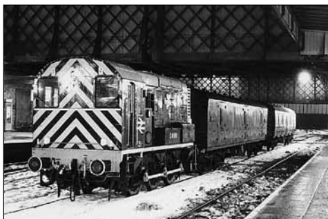
In the days when the UK railways handled parcels traffic, many stations had a resident shunting loco. On 11 February 1991 No. 08691 stands in the middle road at Sheffield. This loco was originally No. D3858, built at Horwich in late 1959, it is still in traffic, now operated by Freightliner. CJM