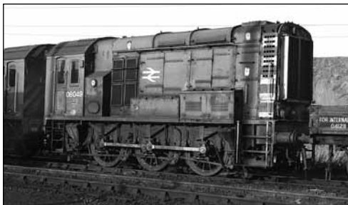
Photographed at Wath on 21 January 1981, this loco was withdrawn just two months later. It was another two years before it was broken up at BREL Swindon. This loco was built at Darlington in August 1953 as No. 13062, later being renumbered to D3062 before becoming 08049. Note the wooden cab door. CJM