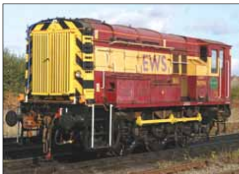
In 1987 three replacement low-cab roof Class 08/9s were converted from standard locos to operate over the BPGV line in West Wales. After the line closed the locos were absorbed into the standard '08' fleet. No. 08994 Gwendraeth is illustrated at Swindon. Kevin Wills