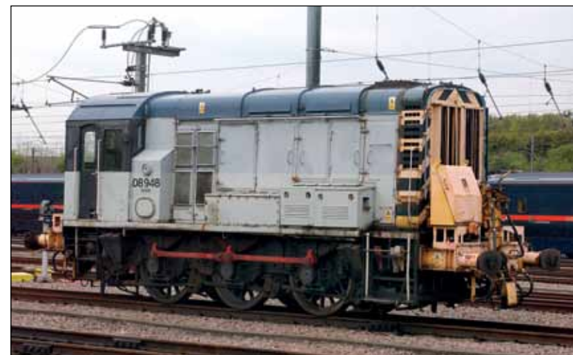
With the introduction of Eurostar stock on Channel Tunnel operation from 1993, the need arose for a shunting loco at North Pole depot in West London which could couple to the power cars and passenger stock for shunting and reformation work. With conventional couplers unsuitable, one loco No. 08948 was purchased by Eurostar from Railfreight and modified with drop head Scharfenberg couplers. The loco is seen at North Pole in 1996. Today, this loco is allocated to the Eurostar facility at Temple Mills. CJM