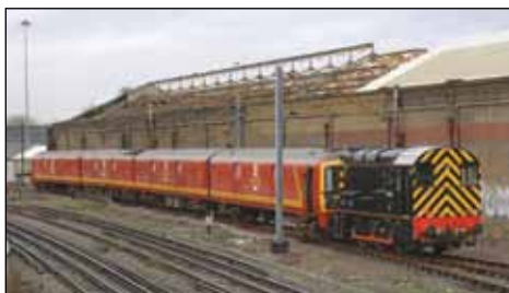
Alstom, which operates a number of depot and works facilities has a fleet of Class 08s for pilot duties. A number of liveries are carried and standardisation into black house colours took several years to complete. No. 08454 is shown shunting a Class 325 Royal Mail EMU at Wembley. No. 08454, was introduced as No. D3569 on release from Derby Works in December 1958, when it was allocated to 17B Burton. CJM