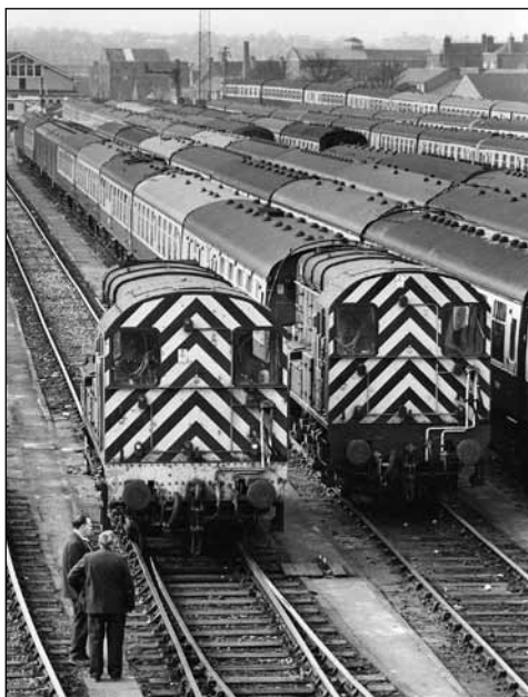
Clapham Junction Yard on BR Southern Region operated two Class 09s as regular shunting power from the 1960s through to the 1990s. Their work consisted of reforming the loco-hauled passenger and van stock, including the Waterloo-Southampton Dock boat trains, the Waterloo-Weymouth boat trains and the Waterloo to Exeter passenger formations. On 5 March 1981 Nos. 09015 and 09017 pose side by side while their driver's discuss local movements. CJM