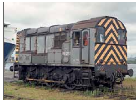
Painted in all-over general grey livery, Class 09/2 No. 09203 is seen shunting at Newport Docks on 21 June 2000. This loco was rebuilt by RFS Kilnhurst in October 1992 from Class 08 No. 08781. In mid-2011 the loco was sold to C F Booth of Rotherham for scrap. CJM