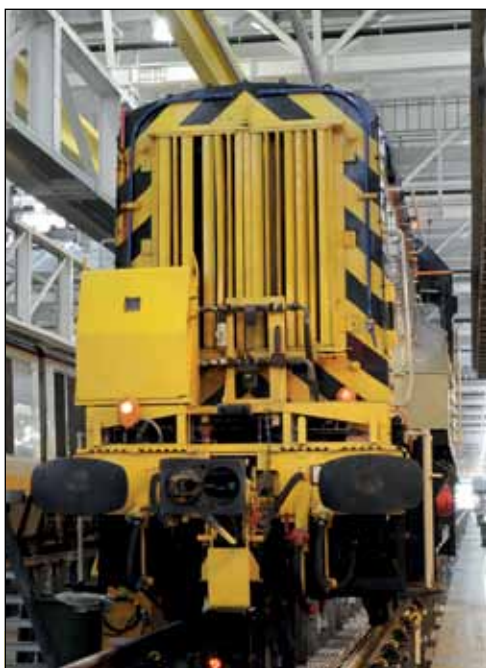
Front end of modified No. 08948, owned and operated by Eurostar and now allocated to the Temple Mills maintenance facility. This view shows the locos drop-head Scharfenberg coupler in the lowered position, enabling easy coupling to Eurostar stock. Note the oval buffers and electric front marker lights. CJM