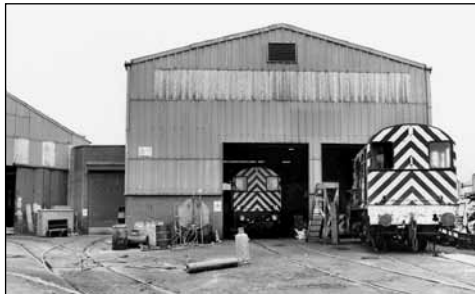
In the early 1990s RFS Engineering at Kilnhurst won a contract for Class 08 overhauls and the conversion of 12 Class 08s into Class 09s. On 11 May 1990 two '08s' are seen at the factory No. 08757 on the left and 08170 on the right, the later being used as a source of spares for the project. CJM