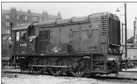
Viewed at Edinburgh St Margarets, No. D3737 was built at Crewe and allocated to the Scottish Region in May 1959. It was renumbered to 08570 and withdrawn in January 1992 being broken up at Motherwell by M C Processors in September 1993. CJM-C