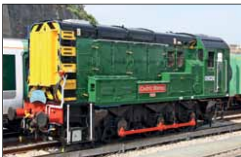
Train operator Southern has one Class 09/0 on its books, this is kept at Brighton for depot shunting duties as well as keeping the third rails of the depot clear from ice in the winter months, using locally fitted de-icing equipment. Now painted in Southern green and carrying the name Cedric Wares, the loco is seen outside Brighton depot in early 2011. No. 09026 started life as No. D4114, being built at Horwich in January 1962 having a first allocation of 24C Lostock Hall. Antony Christie