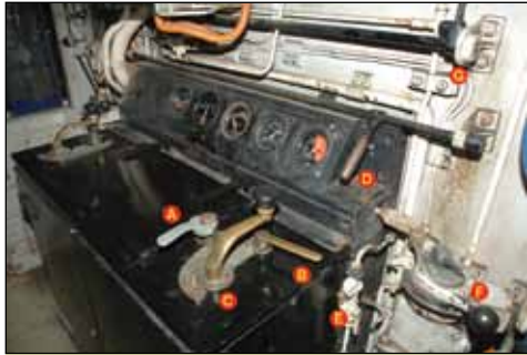
The driving cab and equipment of the Class 09 is the same as that of the Class 08. A standard driving cab is illustrated, viewed from the principal driving position on the left side when the cab end is leading. A: Removable master switch handle, which when rotated against a spring resistance starts the loco (no driver's key is used on these locos). B: Direction controller (forward, engine only, reverse), C: Power controller, D: Direct air brake controller, E: Whistle/horn valve, F: Automatic brake controller, G: Sand valve. Loco No. 09026 illustrated. CJM