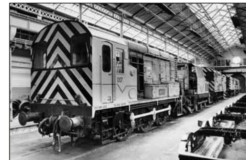
A loco with an interesting history is No. 08077, the original D3102. After withdrawal by BR from Cambridge in November 1977 the loco eventually went to RFS Engineering, Doncaster where it became hire loco No. 007 James. After this career it was sold to Porterbrook and placed on hire to Freightliner. The loco is seen stabled in the E2 erecting shop at Doncaster Works.