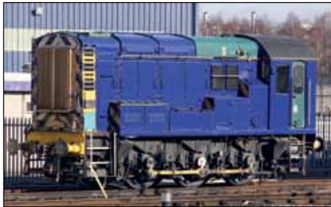
First Great Western have a number of Class 08s on their books for depot piloting duties. No. 08836 is seen at Old Oak Common. This loco was built at Derby Loco Works and introduced in December 1960 to 84E Tyseley shed. The loco now sports air brake only equipment and a hinged buck-eye coupler to allow attachment to HST stock. Nathan Williamson