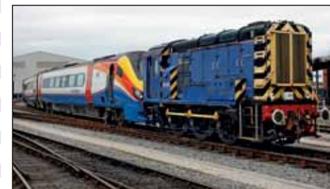
Most of the larger train operators have a small fleet of Class 08 locos for depot shunting duties. East Midlands Trains are no exception and here we see headlight fitted No. 08899 shunting a Class 222 at Derby Etches Park depot. This loco has yellow/black warning ends applied to all forward facing flat surfaces.