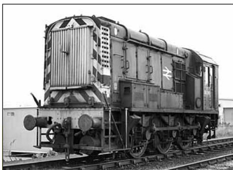
Stabled at Hull King George V Docks on 9 February 1985, No. 08296, was in its earlier days the highest numbered 1948 series standard 0-6-0 shunter when it carried the identity 13366. Delivered new to the Western Region, the loco later moved to the Eastern Region and was withdrawn from York in October 1988. This loco is now in industrial service with Foster Yeoman (Aggregate Industries) at Machan Quarry. However, after withdrawal its body was swapped with that from No. 08787.