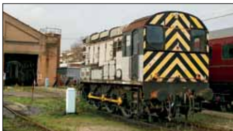
Displaying general grey livery, DBS No. 08918 is seen at Old Oak Common. This loco introduced in October 1962 was withdrawn in April 2011. Antony Christie