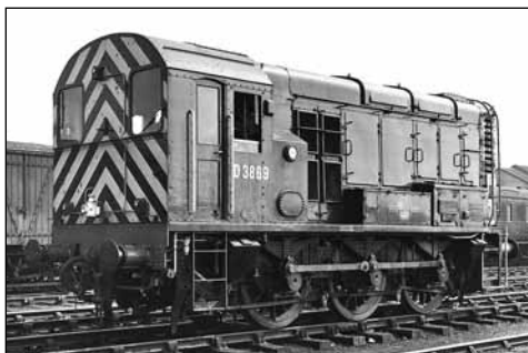
Showing standard BR green livery with full yellow/black wasp ends and still retaining its radiator side step ladder, No. D3869 is viewed from its cab end. This loco delivered new to 14A Cricklewood in February 1960. It was later renumbered to 08702 and was withdrawn from service in May 1998, being broken up by C F Booth, Rotherham in February 2004. CJM