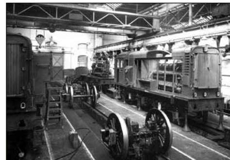
A rare view taken inside the main erecting shop at Darlington Works on 3 September 1957, shows No. D3439, one of the Blackstone-engine fitted GEC equipped locos under assembly. It can clearly be seen from the locomotive in the rear that the power unit was placed on the frame at an early stage of assembly and the body frame built around. In the foreground are the three wheelsets for No. D3439. This loco emerged from Darlington Works on 29 September 1957 and was allocated to King's Cross. CJM-C