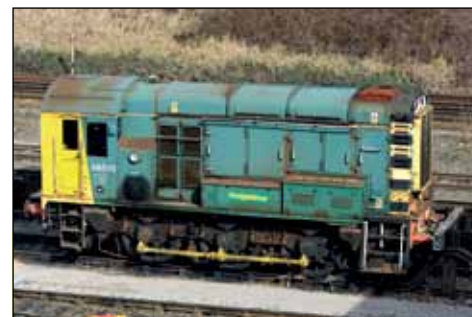
Carrying faded Freightliner green and yellow livery, No. 08575 is viewed at Southampton Maritime Freightliner terminal. This loco was built at Crewe Works and entered traffic in Scotland during June 1959. The loco is now owned by Porterbrook Leasing and on life hire to Freightliner.