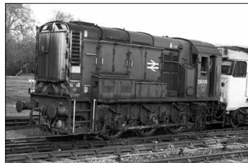
With a large logo Class 50 behind, vacuum brake fitted No. 08479 is seen at Exeter St Davids stabling point on 26 April 1982. Built at Horwich in late 1958, this loco was withdrawn from Cardiff Canton in November 1991 and is now preserved on the East Lancashire Railway. CJM