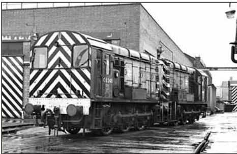
On a wet 22 December 1984, vacuum only Nos. 08248 and 08177 stand 'on shed' at Hull Botanic Gardens. Both locos are in standard BR rail blue livery. No. 08248 was introduced in October 1956 and allocated to the North Eastern Region. It was withdrawn from Hull Botanic Gardens two months before this picture was recorded and was awaiting transfer to BREL Doncaster for disposal. CJM