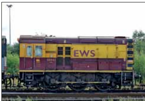
Displaying a slight variation to the standard EWS livery with a deeper height yellow/gold band, No. 08941 is illustrated at Westbury with a yellow flashing beacon on the cab end. This loco was introduced as No. D4171 in June 1962 being built at Darlington. It was withdrawn in May 2008 and broken up by C F Booth, Rotherham in February 2011. Antony Christie