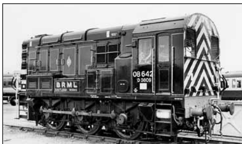
When the UK rail network was split up into small business units, each of the major workshops was allocated one or more Class 08 locos to act as depot pilots. Eastleigh, under the British Rail Maintenance Ltd banner was allocated No. 08642, which was subsequently repainted into L&SWR lined black livery and given its original number D3809. This Horwich-built loco was eventually transferred to Freightliner for use at Southampton being withdrawn in July 1999 and broken up at C F Booth, Rotherham in June 2006. CJM