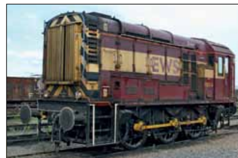
Painted in EWS livery, No. 08514 was introduced in June 1958 from Darlington Works as No. D3676 and originally allocated to 53C Springhead, Hull. By the time this image was recorded the loco had lost its vacuum brake equipment in favour of air braking. No. 08514 was withdrawn by DB-S in April 2011.