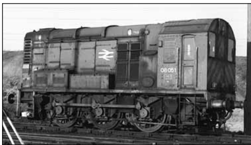
Looking a little weather worn, No. 08051 is seen at Wath on 3 January 1981. Introduced to the Eastern Region from Darlington Works in September 1953, this loco remained in service until July 1982 when it was withdrawn from Wath depot, being transported to BREL Swindon for disposal where it was cut up in May 1986. CJM