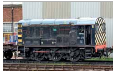
Built by Crewe Works as No. D3740 in June 1959 and first used in Scotland allocated to Dalry Road Shed, this loco was renumbered to 08573 in the early 1970s. It was withdrawn by EWS in January 2005 and is now operated by British American Railway. In 2011 it was on lease to Bombardier for shunting duties at Ilford depot. CJM