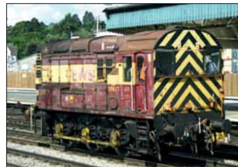
Looking rather the worse for wear and in need of a repaint, EWS-liveried DBS-operated Class 09/0 No. 09017 passes light engine through Newport station on 12 June 2008. The loco is carrying the unofficial name Leo on the cabside. This is one of the batch of '09s' built for the Southern Region with the higher 27.5mph top speed. Nathan Williamson