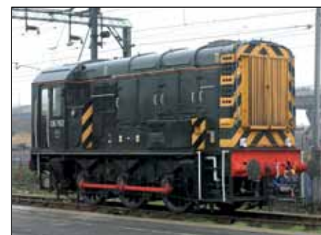
Painted in black livery with wasp ends, No. 08762 is currently owned by British American Railway and used as a hire loco, its latest reported location being Wabtec, Doncaster. When this illustration was recorded on 12 December 2002, it was working for Freightliner at Dagenham. CJM