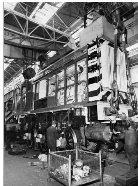
Classified overhauls to the 'standard' 0-6-0 shunting fleet were undertaken at around 10 year intervals or dependant on physical condition and miles operated. In this view we see No. 08606 being reunited with an overhauled set of wheels and traction motors at BREL Swindon in June 1975. Lifting of the loco was achieved by inserting a lifting lug into a cut out in the buffer beam and attaching this via chains to an overhead crane. CJM