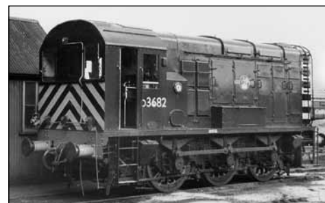
When Doncaster Works produced locos Nos. D3682 and D3683 these were used for early body-end warning experiments. On No. D3682 wasp ends were applied on the lower section of the cab end, while the upper section was finished in black. Carrying a small 'D' prefix to its number, the loco is seen in the Works yard at Doncaster in August 1958 before delivery to Stratford. This loco was later renumbered 08520 and remained in traffic until January 1986 when broken up at Doncaster Works. CJM-C