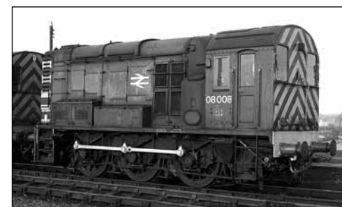
Painted in 1970s standard BR rail blue, No. 08008 was introduced in December 1952 for use in Scotland. It remained operational until August 1983 when it was withdrawn from Thornaby. It was eventually broken up at BREL Swindon. In this view the loco is seen at Doncaster Carr depot. CJM