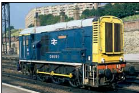
The same loco as shown in the top illustration, No. 08691, still performing station pilot duties at Sheffield but this time six years later in 1997. By the time this image was recorded the double arrow logo had been removed from the cab side and reapplied on the engine room compartment side door. CJM