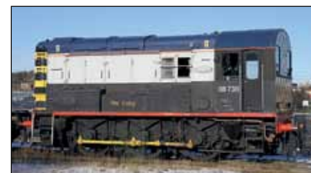
Railcare Ltd operated two ex-BR Class 08s at their St Rollox facility in Glasgow in 2011; both were at the time painted in two-tone grey, and carried local railway names St Rollox and The Caley. No. 08730 The Caley is seen in the works yard in early 2009.