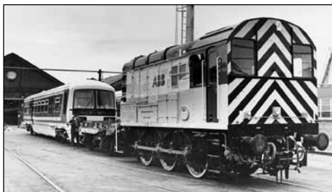
ABB purchased Class 08 No. 08943 from BR and overhauled it at its Crewe site, when it was renumbered as ABB No. 002. The loco is seen shunting new Class 465 'Networker' stock at York. The loco eventually passed to Bombardier Transportation and is now operated by HNRC as a hire loco, in 2011 it was working at Bombardier's Central Rivers facility near Burton. CJM