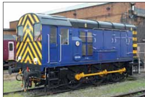
No. 08499 is officially a DBS-owned locomotive but in recent years has operated for Pullman Rail at Cardiff Canton. The loco is painted in mid-blue livery with wasp warning ends and unusually carries its running number on the fuel tank hatch on the bodyside. The loco is seen at Cardiff Canton on 5 November 2007. CJM