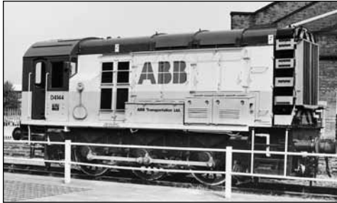
After being withdrawn from Allerton in September 1989, No. 08846 passed to BREL as a works shunter. After the take over by ABB, the loco took up pilotage at Derby Litchurch Lane where during a repaint an incorrect 1957 number of D4144 was applied rather than the correct D4014. Although the works management were told, the loco carried a wrong identity for many years.