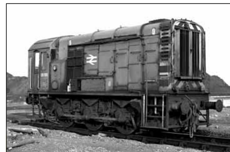
With its battery isolating switch side door wide open and an oil tail light standing on the running plate, No. 08195 poses at Cardiff Roath Dock on 8 May 1982. This Derby built example remained operational until September 1983. After withdrawal it was preserved and is now on the Llangollen Railway. CJM