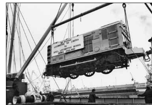
In 1974 Lamco Mining of Liberia purchased five redundant former Southern Region Class 08s from BR. These were given classified attention at BREL Derby Loco Works which included the fitting of specialist drawgear to cope with Lamco rolling stock, air brake equipment and high intensity headlights. After overhaul all were exported to Africa via Liverpool Docks. CJM-C