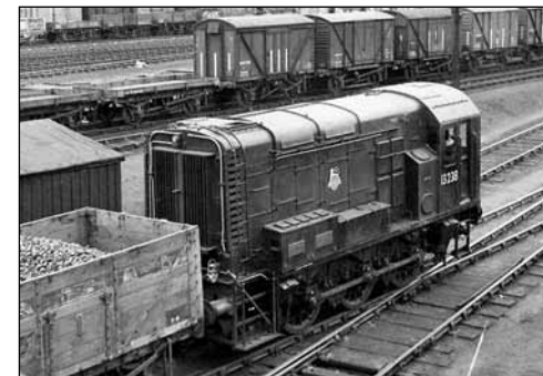
Painted in BR black livery with an early Lion on Wheel motif on the bodyside, No. 13238 shunts at Hull Neptune Street on 11 April 1956. This loco was delivered from Darlington Works two months earlier. Renumbered to 08170 in February 1974, this loco remained in operation until March 1976. CJM-C