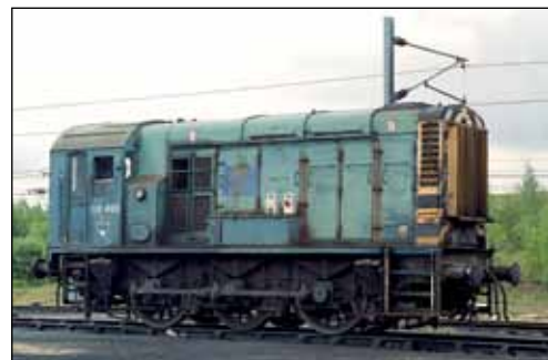
Carrying BR rail blue livery, No. 08492 is seen acting as depot pilot at Millerhill in Scotland on 1 June 2000. This loco was withdrawn from operational service with EWS in December 2000 and is now owned by Harry Needle Railroad Ltd at Barrow Hill.