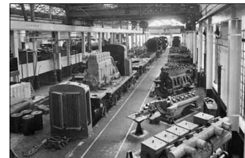
A view of the main erecting shop at Derby Loco Works taken in mid 1955 showing the Crossley ESNT6 production line. CJM-C