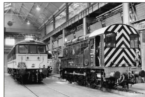
Introduced in November 1960 as No. D4001, this loco became Class 08 No. 08833, and while allocated to Stratford depot in East London became the GER blue liveried Liverpool Street Pilot. The loco is seen in this view inside the Heavy Repair Shop at Stratford on 26 March 1991. Soon after this image was recorded the loco was taken out of traffic and took its place in the 08-09 conversion project being undertaken by RFS Kilnhurst, emerging as No. 09101. CJM