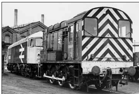
Now preserved on the Bodmin & Wenford Railway in Cornwall, No. 08444 is seen in its BR days at BREL Doncaster Works propelling a brand new Class 56 towards E2 shop in March 1981. This loco was originally No. D3559 and was built at Derby Works in late 1958.