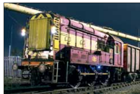
By 2011, DB-Schenker were operating a small fleet of Class 08s fitted with remote control equipment, allowing an operative on the ground to control the locomotive using a hand set. No. 08804 painted in EWS maroon and gold livery but still with a BR double arrow logo is shown with its frontal and side 'auto' lights illuminated. Antony Christie