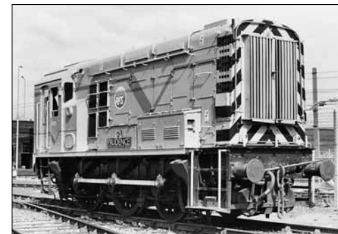
RFS Engineering, the predecessor of Wabtec Doncaster, set up an important loco hire business in the 1980s and 1990s with a large number of Class 08s refurbished for spot hire. No. 08164, running as RFS No. 002 Prudence, poses in the works yard at Doncaster in 1989. This loco was later sold into preservation and is now on the East Lancs Railway.