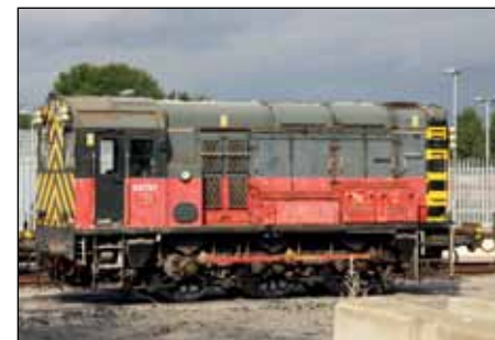
Carrying the short lived Rail Express Systems red and grey livery, No. 08757 is viewed at Westbury. This loco is fitted with remote control equipment, identifiable by the extra lights on the loco end. 08757 was built by BR Horwich Works in early 1961. Antony Christie