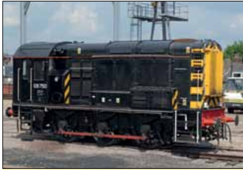
After withdrawal by EWS in December 1999, No. 08750 was sold to the private sector and is now operated by British American Railway and is used as a hire locomotive. This illustration was taken on 1 June 2007 when the loco was working at Hornsey depot, in 2011 the machine was working at Ilford depot. CJM