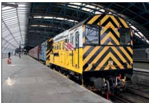
Under Harry Needle Railroad Co ownership No. 08943 was fully overhauled to an extremely high standard and repainted into HNRC yellow and grey livery with wasp warning ends. In the summer of 2010/11 the loco was involved in The Railway Children play enacted at the closed Waterloo International station, after this work was completed it went to Central Rivers. Antony Christie