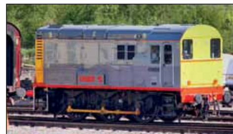
No. 08868 is one of the Harry Needle Railroad hire locos, usually based at Barrow Hill but used for contract work. No. 08868 is seen painted in two-tone grey with LNWR branding and a plain yellow warning end at the LNWR workshops in Crewe. No. 08868 was introduced as No. D4036 from Darlington Works in November 1960, it was withdrawn by BR in December 1992 from March Depot.