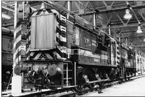
Painted in BR rail blue but with Express Parcels (Red Star) branding and carrying the unofficial name Starlet, No. 08721 is seen inside Manchester Longsight shed. This loco, introduced in June 1960 on release from Crewe Works was first allocated to Scotland, but for many years has worked in the Manchester area. In 2011 it was operated by Alstom Traincare, Manchester. CJM