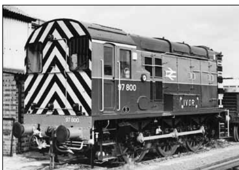
No. 08600, the original D3767 built at Derby in mid-1959 entered Departmental service at Slade Green Depot on the Southern Region in May 1979. It was then allocated the number 97800 and repainted in red/blue livery with the painted name Ivor on the battery box sides. The loco returned to capital stock in March 1980 and after withdrawal in 1997 passed to Industrial service with A. V. Dawson in Middlesborough. CJM