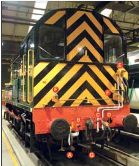
Class 09 cab end equipment positions, also applicable to Class 08. A: Main reservoir pipe (yellow), B: Position for vacuum brake pipe (white), C: Air brake pipe (red), D: Main reservoir pipe (yellow), E: Waist-level dual control main reservoir and air brake pipes, F: Marker/tail light. G: Screw coupling and hook. Loco No. 09026 is illustrated. On some locomotives additional marker/tail lights can be found. Most locos do not have waist-level air connections. CJM