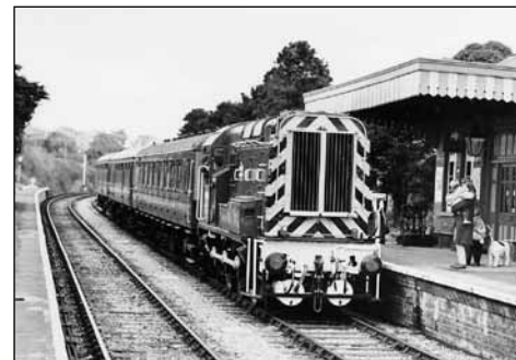
The preservation movement has purchased a significant number of Class 08s and returned them to full operational condition. In the 1990s the West Somerset Railway was the home to No. 08850 which is seen superbly restored to BR blue livery at Blue Anchor on 29 October 1994 powering the 13.50 to Minehead. This loco was subsequently transferred to the North Yorkshire Moors Railway. 08850 was withdrawn from Reading in 1992 in a fully operational condition. CJM