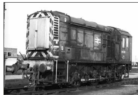
With an instant coupling hanging on the front hook, vacuum brake No. 08085 rests between duties at Thornaby on 7 February 1982. Introduced from Derby Works in March 1955 as No. 13110, this loco was later numbered D3110 until its TOPS number was applied in the 1970s. After 31 years of service the loco was withdrawn in March 1986 from Gateshead. CJM