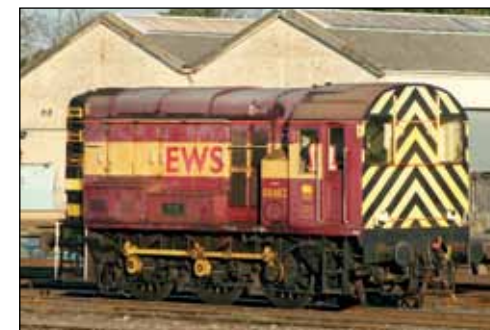
Carrying standard EWS livery, No. 08482 Don Gates 1952 - 2000 is seen from its cab end at Eastleigh yard on 27 December 2008. This loco was introduced in September 1958 and was a product of Horwich Works. It was withdrawn on April 2010 and cut up at C. F. Booths, Rotherham in February 2011. This loco was modified for air brake only operation.