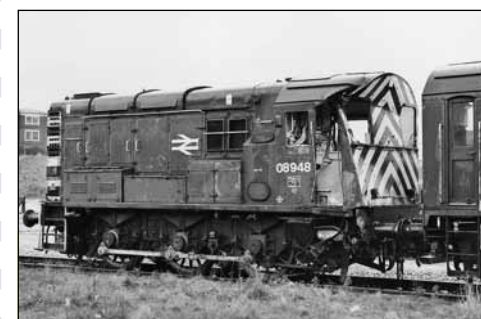
No. 08948, which is now the Eurostar pilot loco based at Temple Mills (see next page) had a serious operating problem at Acton Yard in February 1984 when it collided with a rake of wagons. After recovery, the loco was taken to Old Oak Common for assessment and repair at Derby Works. Our view shows the loco at Old Oak Common. CJM