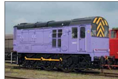
Painted in a somewhat unconventional livery, No. 08447 sports lilac bodywork and only a half yellow/black wasp end. The loco was withdrawn by BR in November 1994 from Carlisle and is now operated by John G. Russel Transport, Glasgow. The locomotive is seen at Long Marston on 7 June 2008. CJM