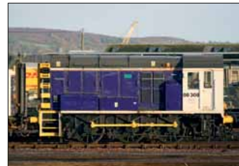
Built by BR Derby Loco Works in August 1957 as No. D3378 and allocated to 55D Royston, the subsequent No. 08308 was withdrawn by BR from Derby in February 1992 and sold to the private sector. The loco is now part of the British American Railway operation and in 2011 was operated under hire to First ScotRail at Inverness.