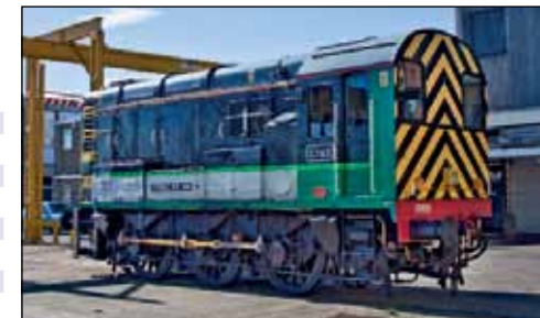
Painted in London Midland livery and allocated to Tyseley for depot shunting duties, No. 08616, the original D3783, now sports a cast 3783 number plate on the cab side. The loco also carries a central headlight and a cast nameplate Tyseley 100. D3783 was introduced in September 1959, a product from Derby Locomotive Works. John Stretton