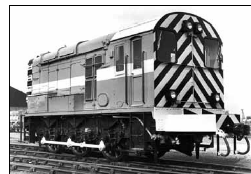
After the five Lamco locos were converted at BREL Derby in 1974 a small media event was held to mark the event, where the former No. D3092 was posed in the works yard at Derby. This view clearly shows the new drawgear installed to cope with buck-eye couplings. Few other structural modifications were done to the fleet. CJM