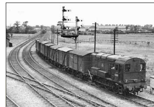
No. 13081, introduced from Darlington Works in February 1954 is seen near Hull working a trip freight in 1956. Note the target No. 7 on the front end. In September 1957 this loco was renumbered to D3081. It was renumbered into the TOPS system as 08066 in January 1974. The loco was withdrawn in September 1977 and cut up at BREL Doncaster Works. CJM-C