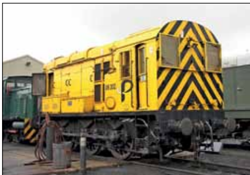
No. 08202 now painted bright yellow, was built at Derby Loco Works in October 1956 and allocated to the Southern Region. After going to the Western Region it was withdrawn in May 1989 from Cardiff. It then entered industrial service and for several years worked for The Potter Group. In more recent times the loco has moved to the Gloucestershire and Warwickshire Railway from where it acts as a hire loco and in 2011 was working at Celsa Steel in Cardiff.