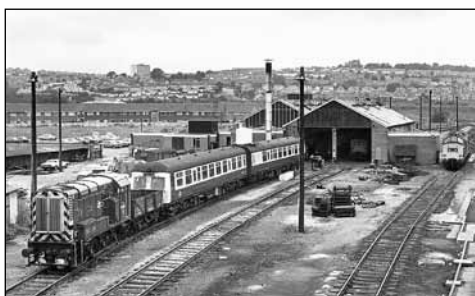
Standing outside the west end of Severn Tunnel Junction Shed on 14 July 1980, blue liveried '08' No. 08594 stands attached to a Class 120 DMMU, while Class 37s are stabled in the shed building and yard. No. 08594 entered traffic in December 1959 on release from Crewe Works. It was withdrawn in December 1999 but not broken up until October 2010 by European Metal Reprocessing at Kingsbury. CJM