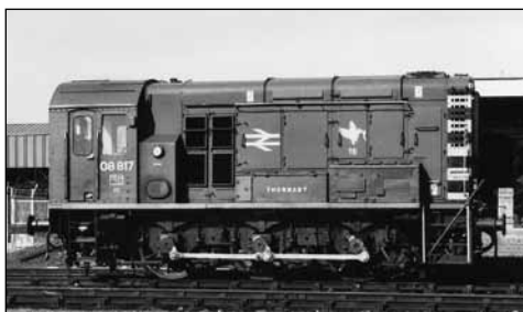
In the 1980s it was common for some of the larger depots to customise their locos, one was Thornaby, where local names and the Kingfisher logo was applied to many locomotives. No. 08817 is seen at Darlington on 1 May 1986 with the painted name Thornaby. This loco entered service from Derby Works in August 1960 allocated to the Western Region. It was withdrawn in April 1999 and eventually broken up by HNRC at Bryn Engineering, Wigan in January 2006.