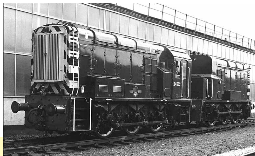
In original condition 'master & slave' set No. D4506 is seen at Tinsley depot soon after delivery from Darlington Works. The loco nearest the camera was the original D4187. CJM-C