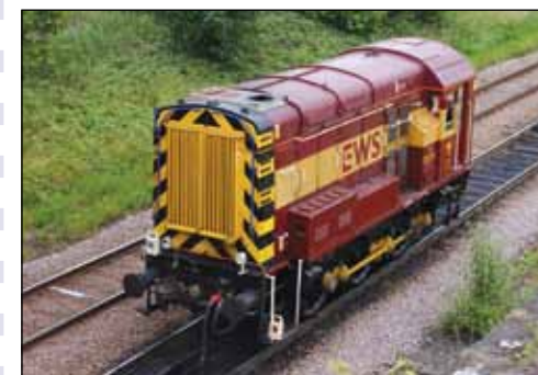
Painted in standard EWS maroon and gold livery, No. 08703 is seen from an elevated view at Toton in 2001. This loco is air brake fitted only and sports a swing head combination coupler, allowing connection to modern freight stock. This loco is one of the few remaining operational with DBS. CJM