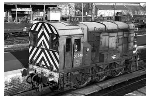
This Darlington built loco No. 08246, which was previously numbered D3316 and 13316 shows BR rail blue at Stirling on 16 April 1982, but with the BR double arrow logo on the batterybox side, rather than the equipment room door. This loco was withdrawn in August 1982 and was broken up by D Christie of Camlackie. CJM