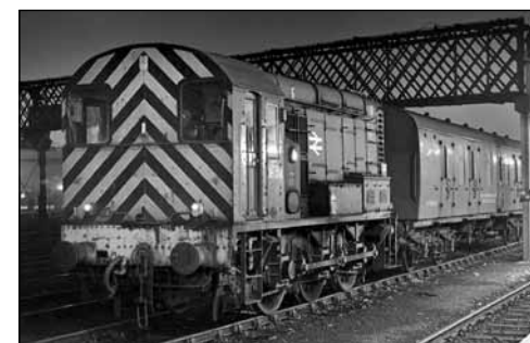
Coupled to an HST 'enparts' wagon at Derby on 30 January 1980, No. 08014 undertakes the station pilot duty. This loco was built at Derby Loco Works in April 1953 as No. 13021, it was renumbered to D3021 in February 1958 and into the TOPS series in March 1974. It was withdrawn five months after this image was recorded and broken up at C. F. Booth, Rotherham in November 1981.