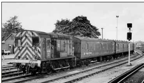
The second of the Class 09s, No. 09002 (D3666) is seen shunting vans in Woking Down Yard on 15 May 1981. This example also sports additional cab end marker lights. Introduced in February 1959 for the Southern Region, this loco was withdrawn in September 1992 and entered preservation with the Devon Diesel Society at Buckfastleigh, but in 2011 it was returned to the National Network being sold to GBRf. CJM