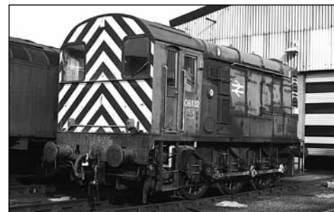
With a modified cab end sporting just two marker lights, No. 08132 is seen stabled at Crewe Diesel Depot on 1 April 1984. CJM